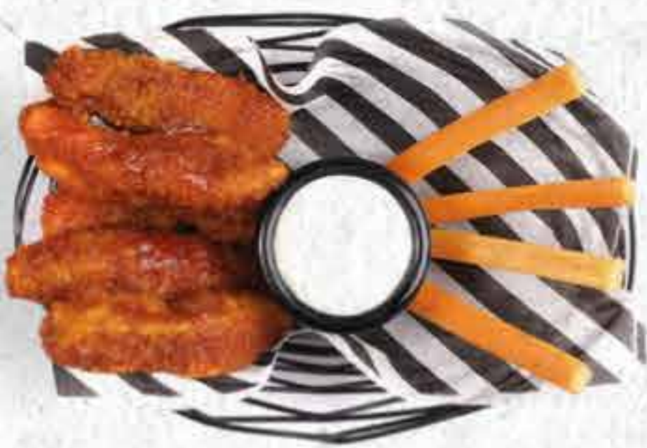
Louisiana Chicken Tenders