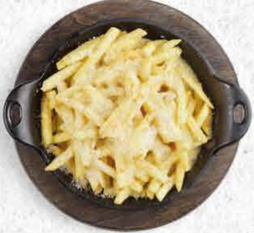
Parmesan Truffle Fries